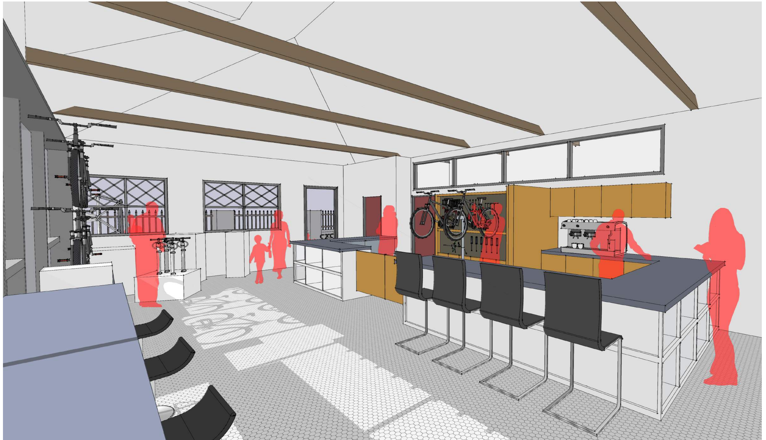
BIKE KITCHEN - INTERIOR