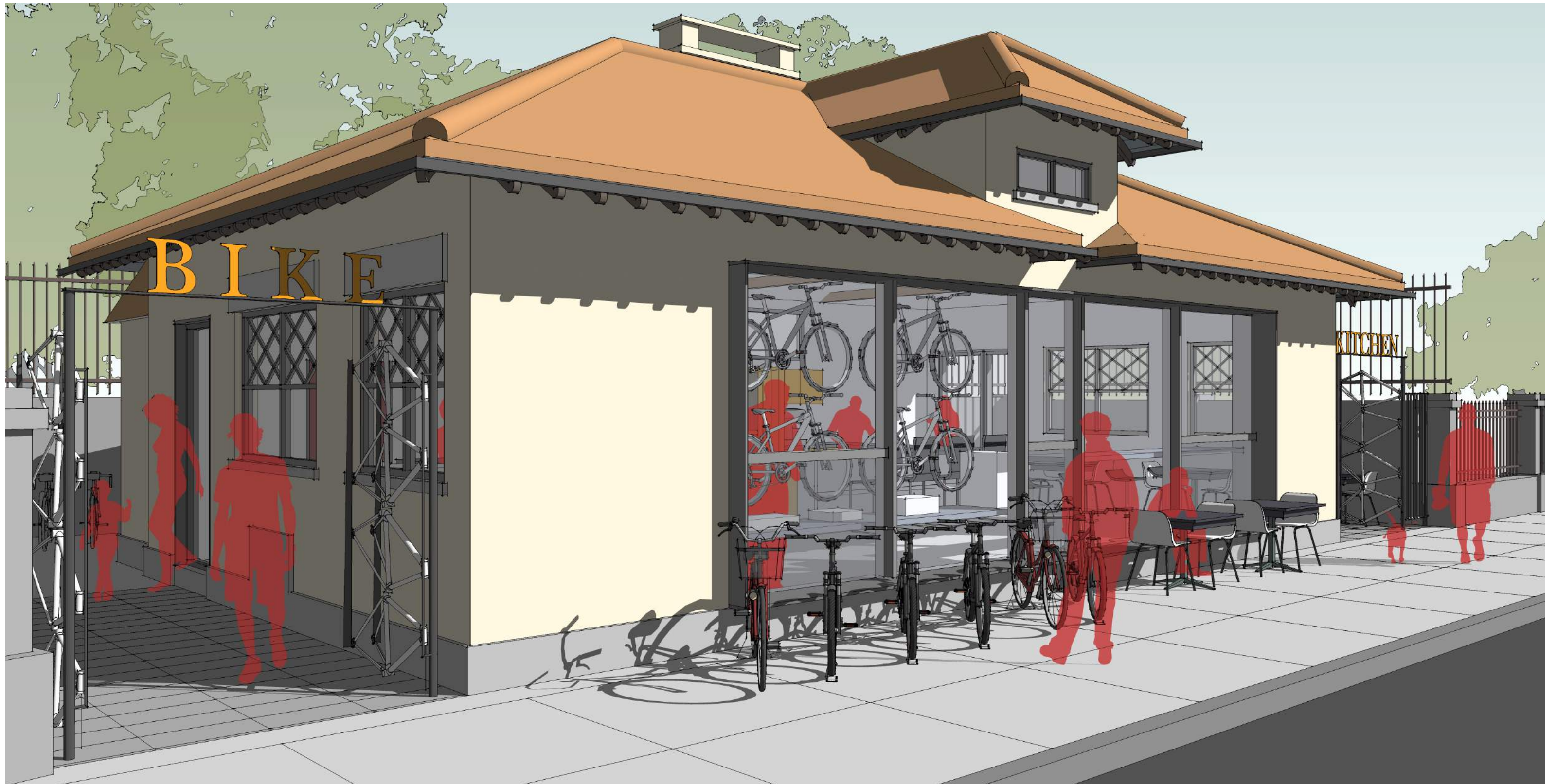
BIKE KITCHEN - SHOP ENTRANCE